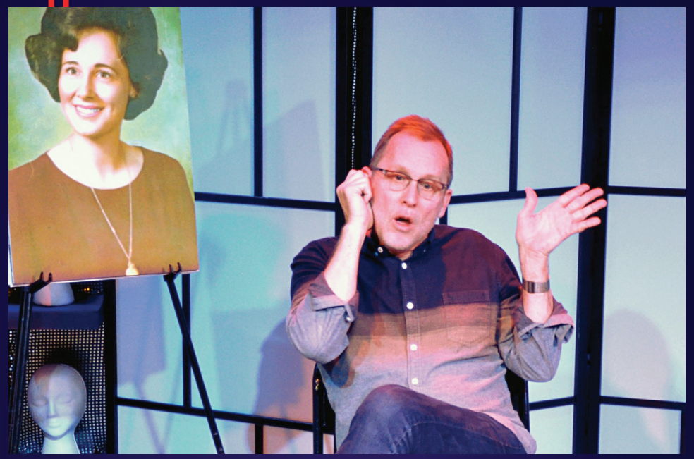
Six Characters in Search of a Play