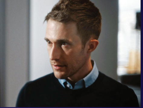
The Office is Mine