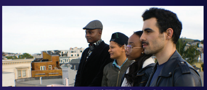
UNSETTLED: Seeking Refuge in America

THE MODERN CAFE 200 Darnell St. Fort Worth, TX 76107