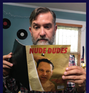
How I Came Out