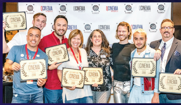
2018 Festival Winners