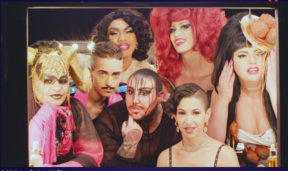
A Night at Switch N' Play