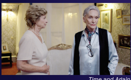
Time and Again