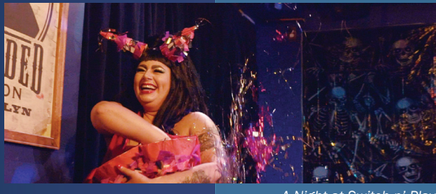
A Night at Switch n' Play

Closing Night Reception (Filmmaker, Sponsor and VIP badge holders)