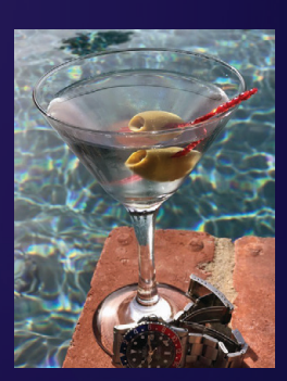
Brunch Before Baptism