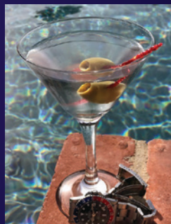
Brunch Before Baptism

Dir. Michael Varrati | USA | 2019 | 14 min