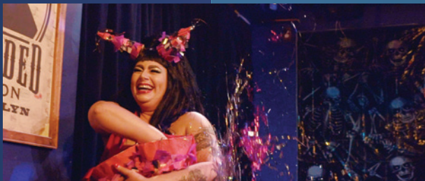
A Night at Switch n' Play

9:30 p.m. Closing Night Reception (Filmmaker, Sponsor and VIP badge holders)