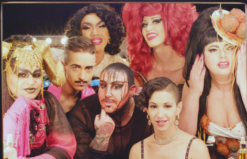
A Night at Switch N' Play