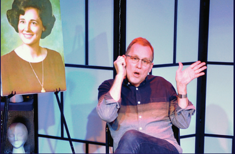
Six Characters in Search of a Play