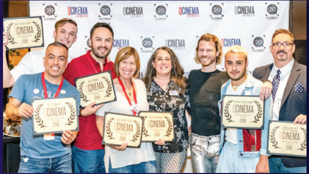
2018 Festival Winners