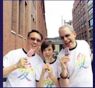
Double Dads and One Queer Teen