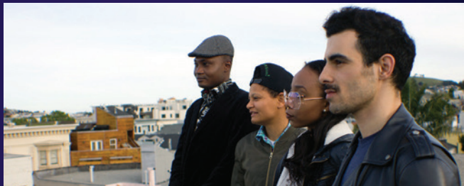
UNSETTLED: Seeking Refuge in America

THE MODERN CAFE 200 Darnell St. Fort Worth, TX 76107