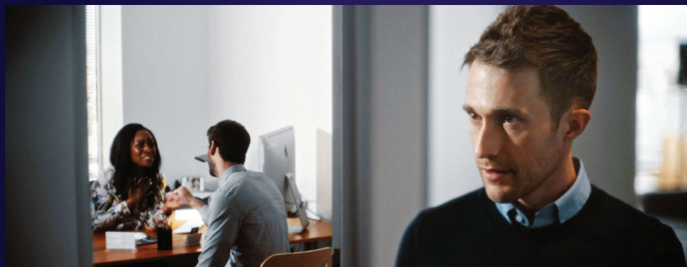
The Office is Mine