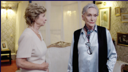
Time and Again