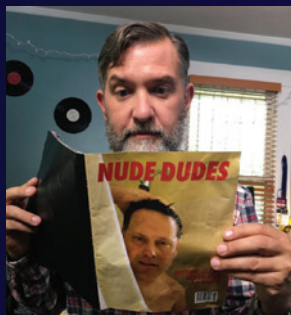
How I Came Out