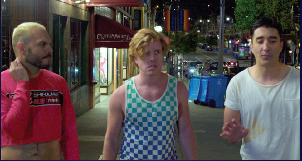
Bathroom Stalls & Parking Lots