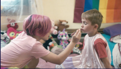
Welcome to the Ball