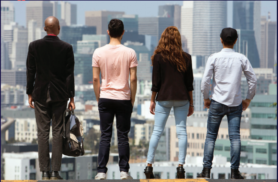
UNSETTLED: Seeking Refuge in America